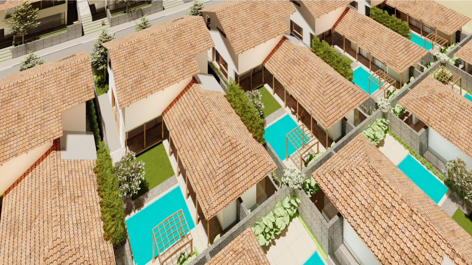
MASTER PLAN OVERVIEW