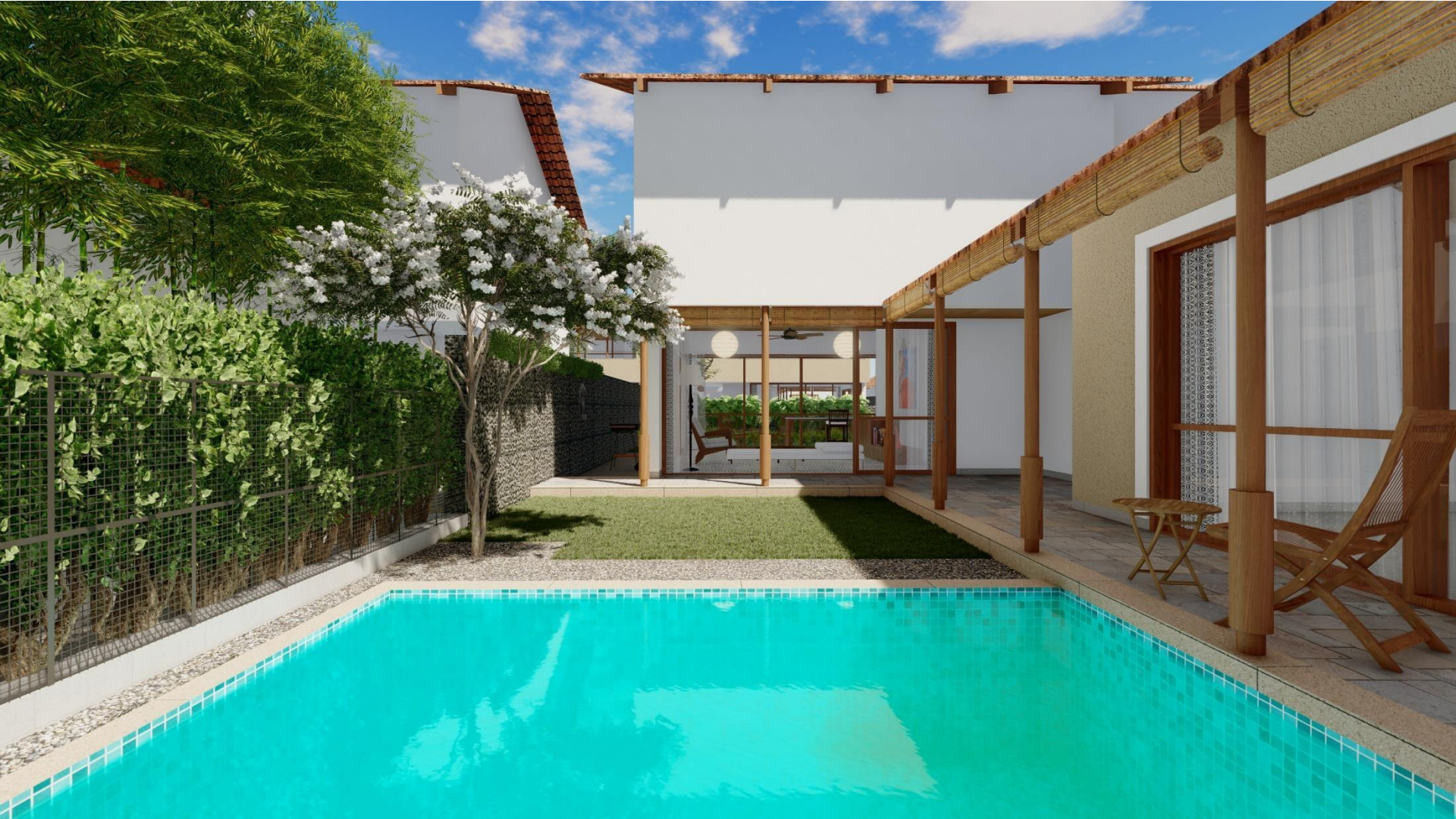
LIVING ROOM FROM POOL DECK