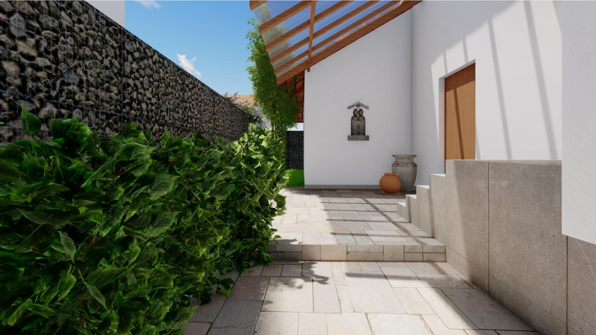
COVERED ENTRANCE COURT FROM PARKING