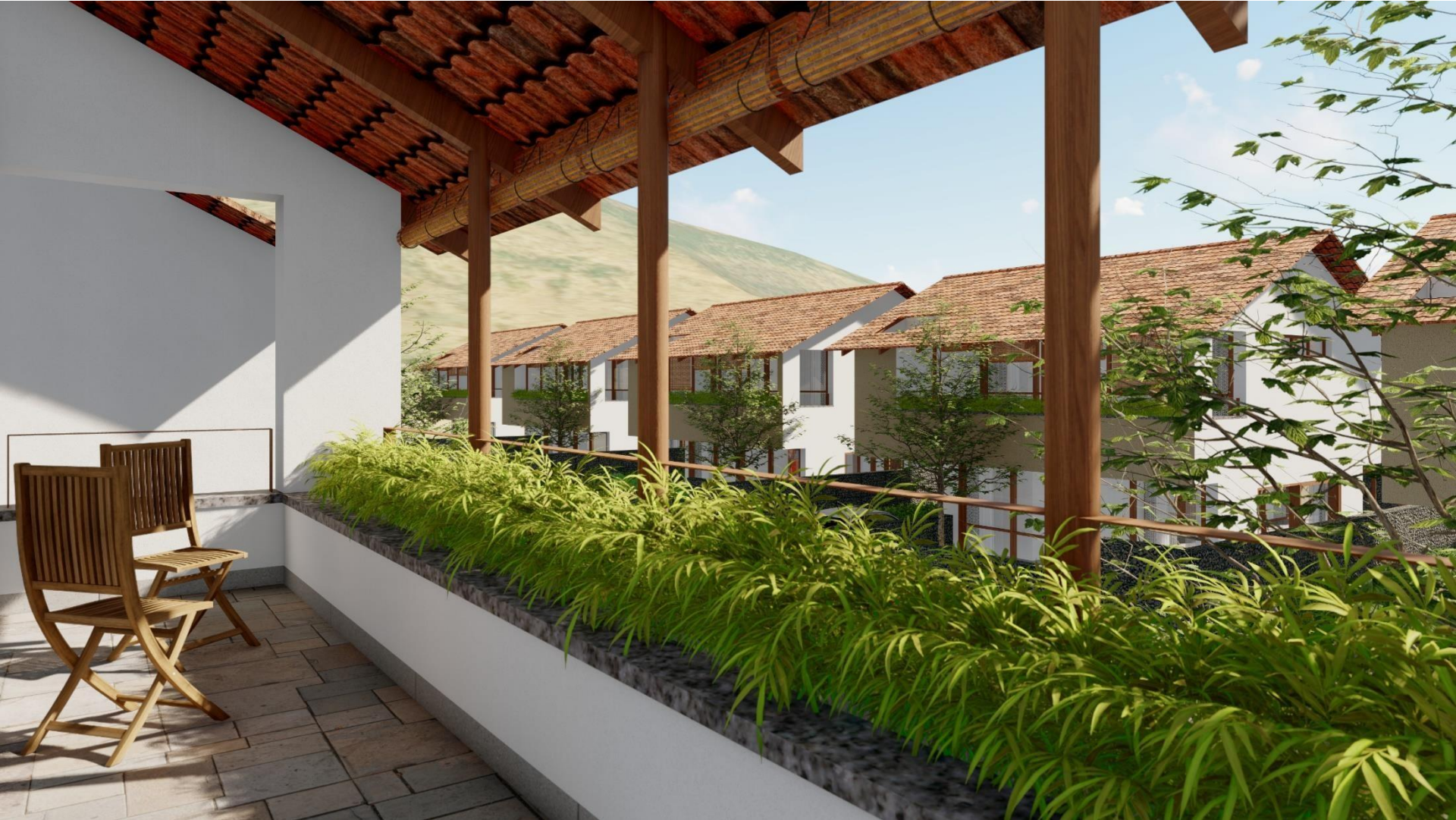
FIRST FLOOR BALCONY