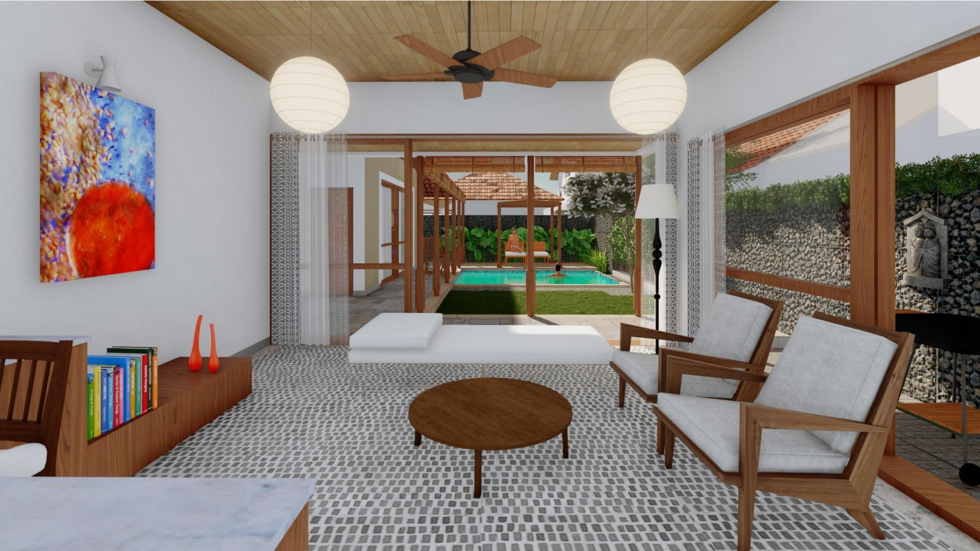
LIVING ROOM LOOKING TOWARDS LAWN & POOL