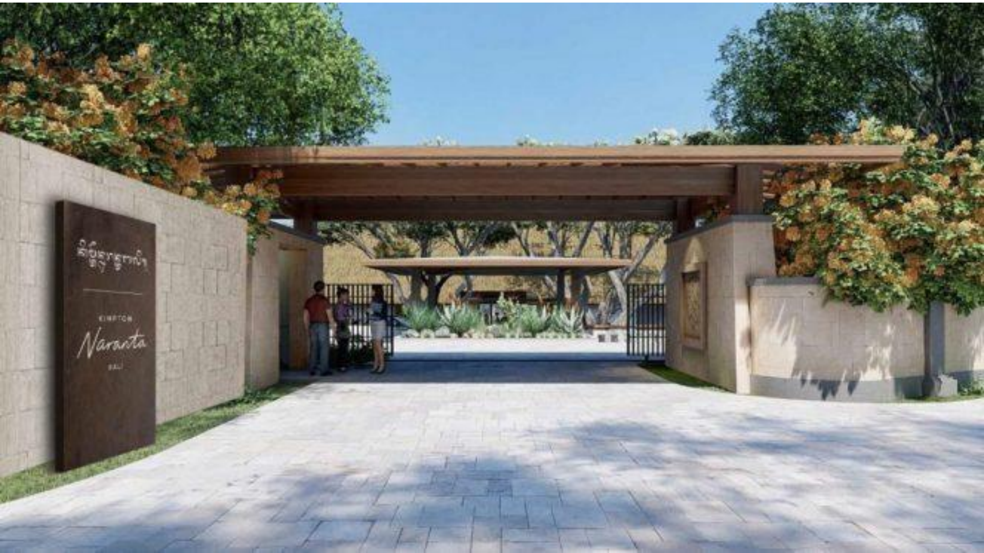
ENTRANCE GATE (REFERENCE IMAGE - KIMPTON NARANTA BALI RESORT)