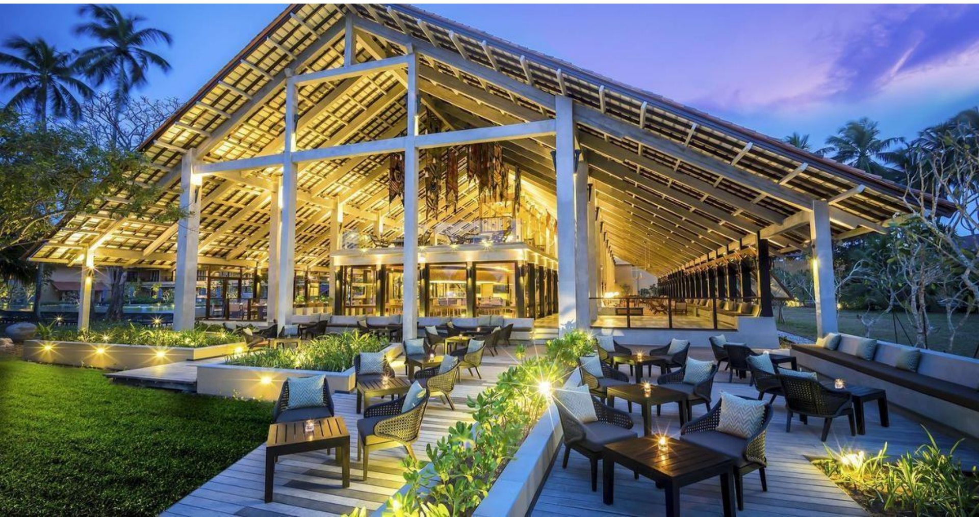
CLUBHOUSE (REFERENCE IMAGE - ANANTARA KALUTARA RESORT)