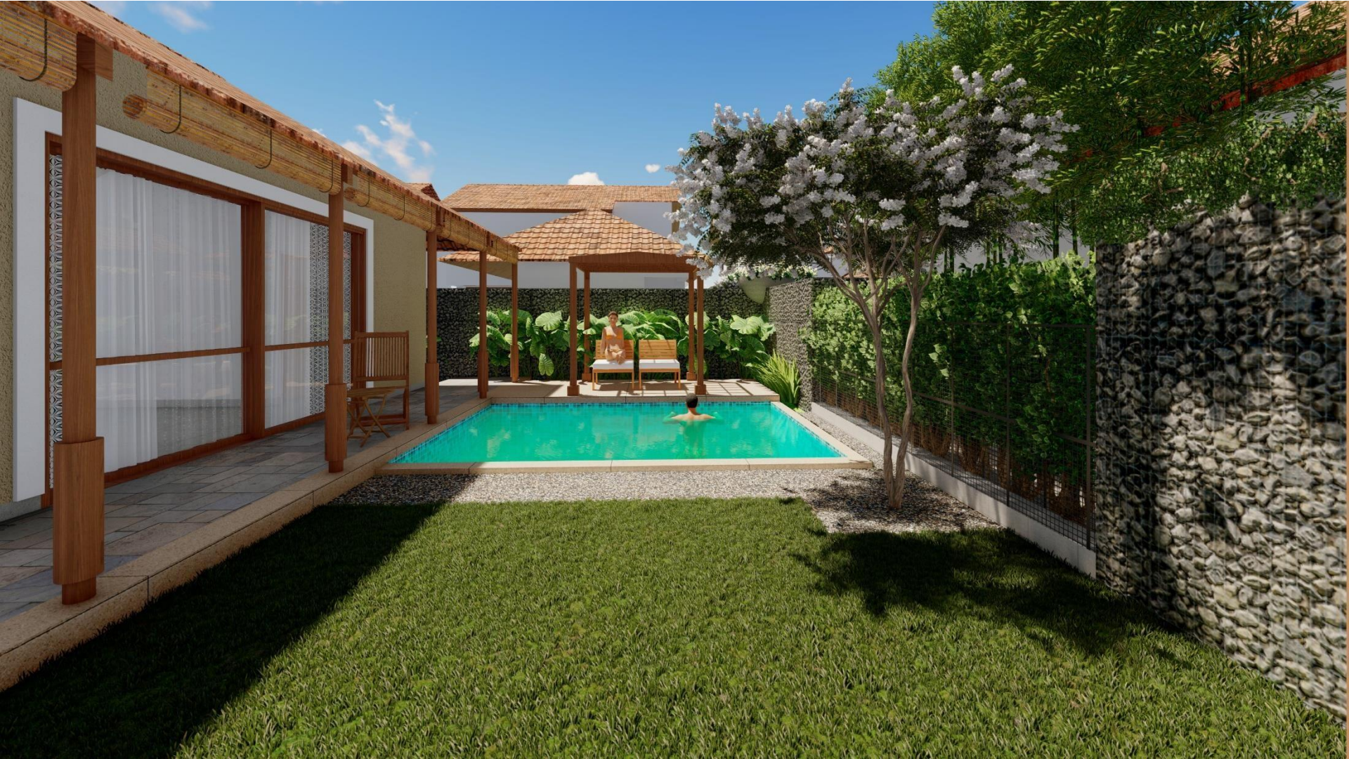
POOL & LAWN FROM LIVING ROOM